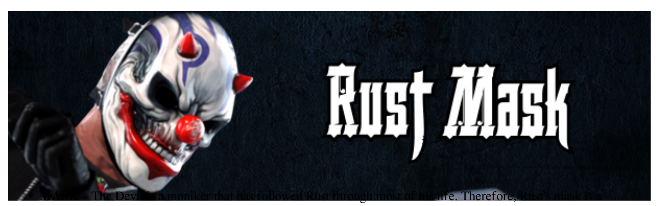
combination of a smiling clown with ominous horns protruding from the forehead, letting everyone know that the Devil is here.

all you needed. He's upgraded it a bit though, to a metal Chain Whip that'll cause some serious damage.