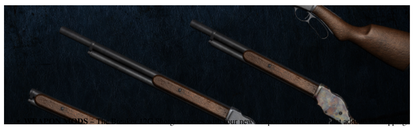
power and concealability.