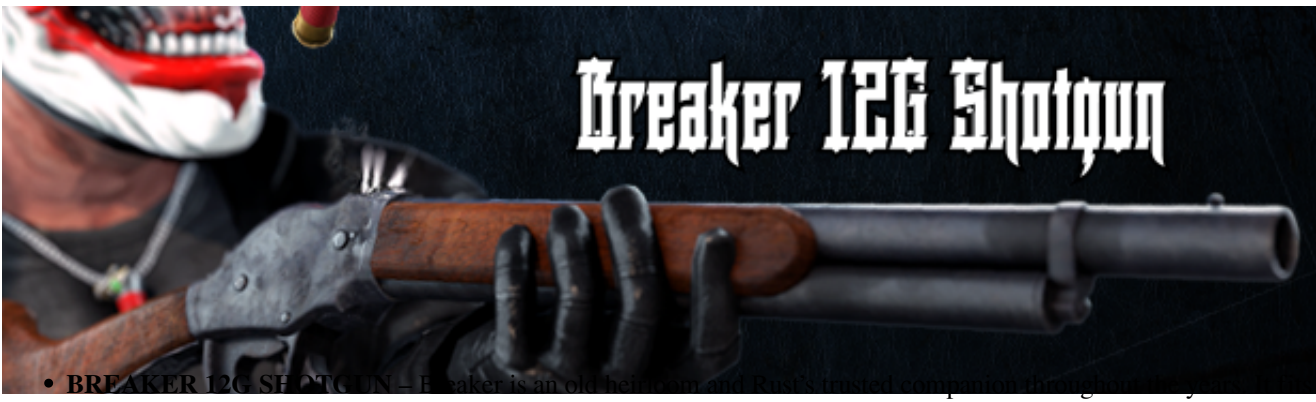
perfectly on his bike and even though it's old, Rust can always rely on it doing its job.